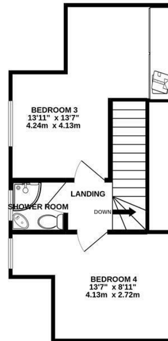
TOTAL FLOOR AREA: 1032 sq.ft. (95.9 sq.m.) approx.

Whilst every attempt has been made to ensure the accuracy of the floorplan contained here, measurements of doors, windows, rooms and any other items are approximate and no responsibility is taken for any error, omission or mis-statement. This plan is for illustrative purposes only and should be used as such by any prospective purchaser. The services, systems and appliances shown have not been tested and no guarantee as to their operability or efficiency can be given. Made with Metropix ©2022